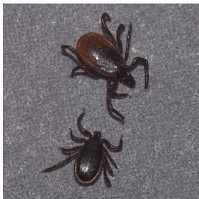
Gary Alpert, Harvard Univ. / insectimages.org

Brownish black to black, \frac{1}{8} inch, jumping insects, blood feeders that may transmit disease.