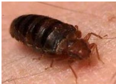
Gary Alpert, Harvard Univ / insectimages.org