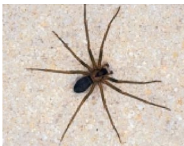
DPI-Archive, Florida DACS / insectimages.org

Dark brown to black, carriers of many diseases and heartworms.