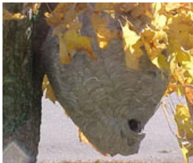
RITA Parkins / insectimages.org